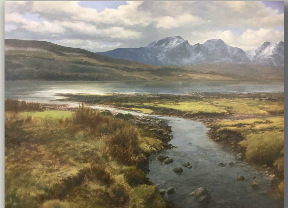
“Snowline, Blaven” Latitude 57° 13’ North

He continues to paint the evocative Southern Landscapes for which he is renowned, but has added the Grandeur of the Scottish Highlands to his repertoire.